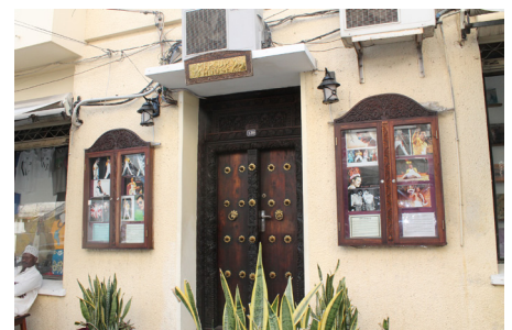
Visit Freddie Mercury's childhood home in Zanzibar